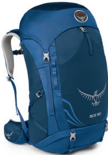
ACE 50 [ages 8-14*]