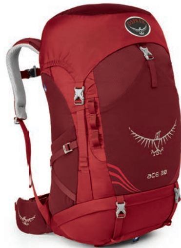
ACE 38 [ages 6-11*]

The Ace Series are technical backpacks for young outdoor enthusiasts ages 10-18 with the same features and fit as Osprey's adult backpacks. An ultra-adjustable torso and hipbelt allows the pack to grow with the user providing years of value and comfort. The Ace 75 provides the capacity and organization required by outdoor education groups.