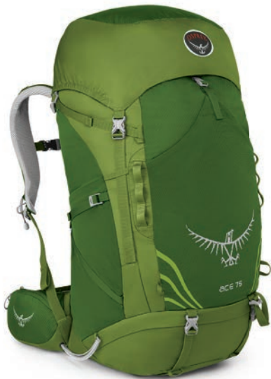
ACE 75 [ages 11-18*]