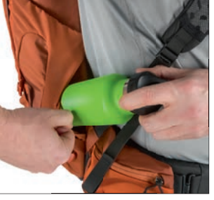
DUAL ACCESS SIDE STRETCH MESH POCKETS 85L/70L/60L/65L/55L Dual access side stretch mesh pockets secure contents and provide access when wearing the pack. Items can be inserted from the top or side.