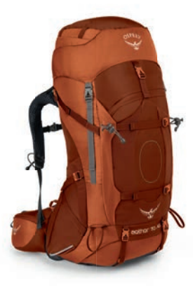
AETHER AG 70