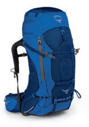
AETHER AG 60