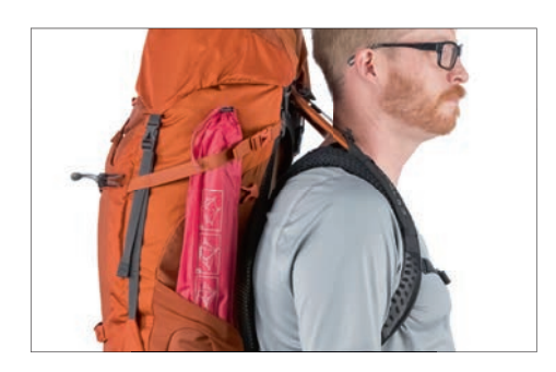
DUAL UPPER SIDE COMPRESSION STRAPS 85L/70L/60L/65L/55L Dual upper side compression straps with quick release buckles compress and stabilize loads for optimal carry and can be used to secure items to side of pack.