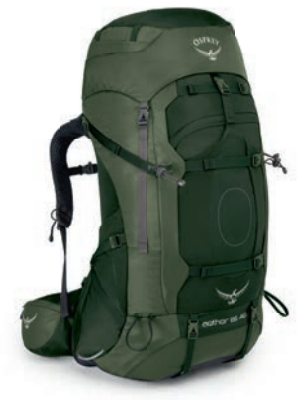
♂ AETHER AG 85