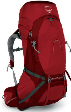
ATMOS AG™ 50