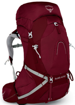
AURA AG™ 50

Welcome to Osprey. We pride ourselves on creating the most functional, durable and innovative carrying product for your adventures. Please refer to this owner's manual for information on product features, use, maintenance, customer service and warranty.